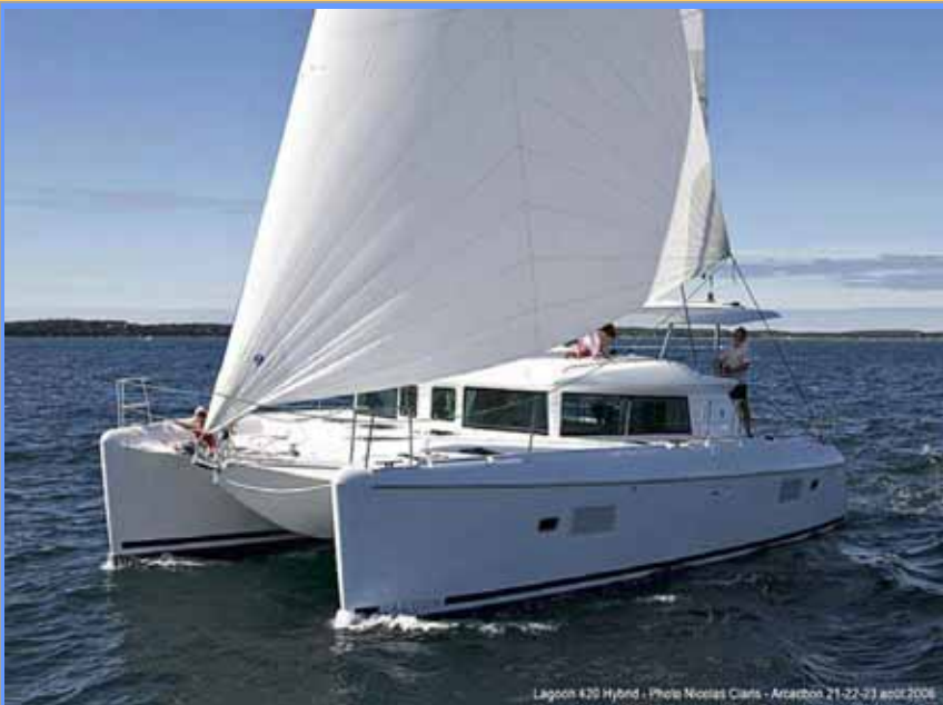
Lagoon 420 Hybrid - Arcarbon 21-22-23 août 2008